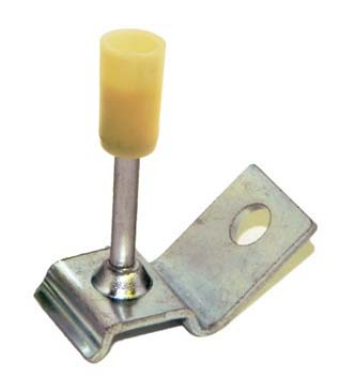
FIGURE 2—STANDARD CEILING CLIP ASSEMBLY